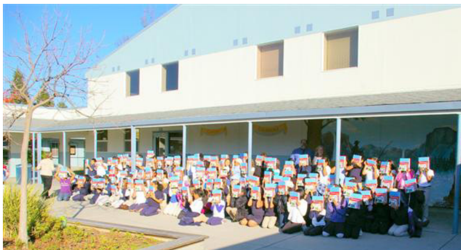
Third Graders at John Muir Elementary proudly display their new dictionaries.